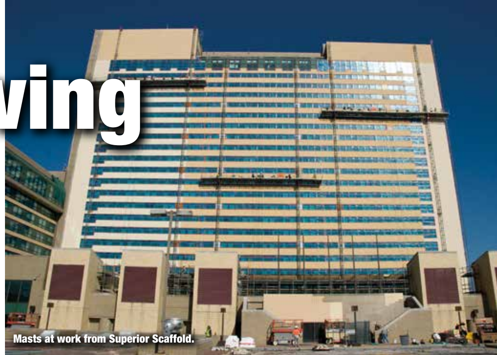
Masts at work from Superior Scaffold.