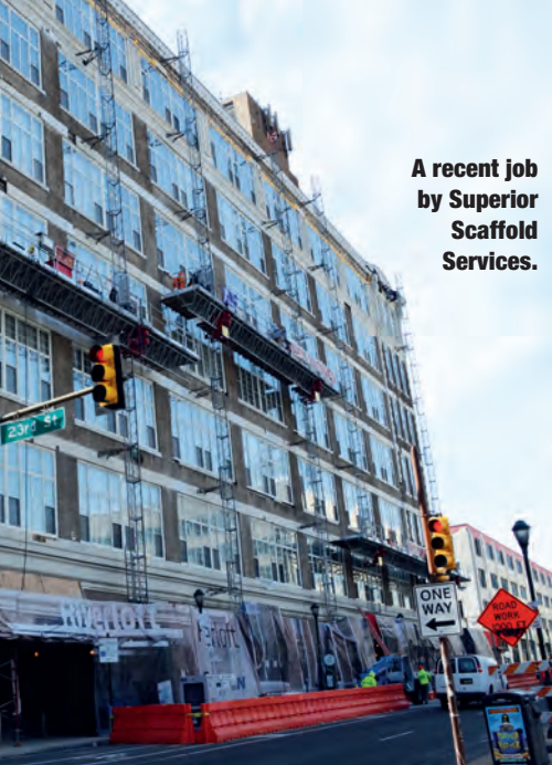
A recent job by Superior Scaffold Services.