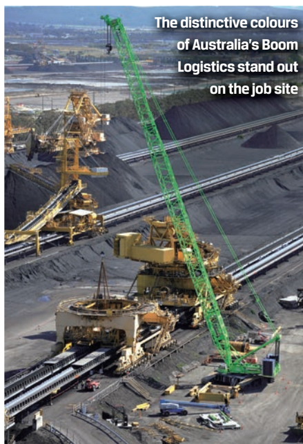
The distinctive colours of Australia's Boom Logistics stand out on the job site