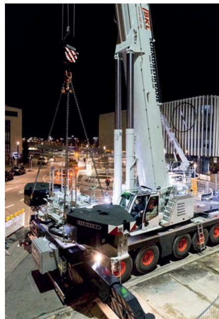
BKL dismantling a tower crane in Ingolstadt, Germany. The Bavarian company has moved into the top 100 this year at 93rd place (from 108) following recent years of strong expansion

only positive was an increase in the number of depots, perhaps suggesting that these leading companies have invested further in getting closer to their customers. At 507 depots the number was up 2% from the 497 of 2018. An increase in this number has been consistent for many years. The number of employees, however, was down, by 4.5%, or 1,428 people, to 30,460 from 31,888 and reversing two years of rises. There were 4% fewer wheeled cranes and 1% fewer lattice cranes (just 41 units).